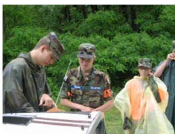
Griffith SAREX was a great success despite some wet weather.