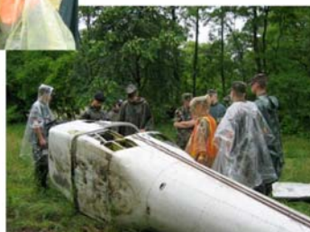
Ground teams inspect simulated wreckage and distress beacon.